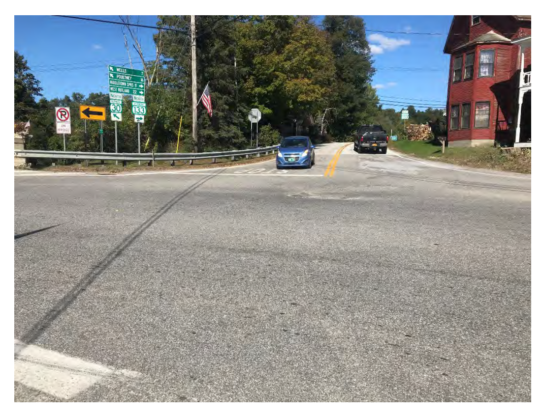
Sidewalks will be installed along VT-133 to the Pawlet Community Church parking lot.