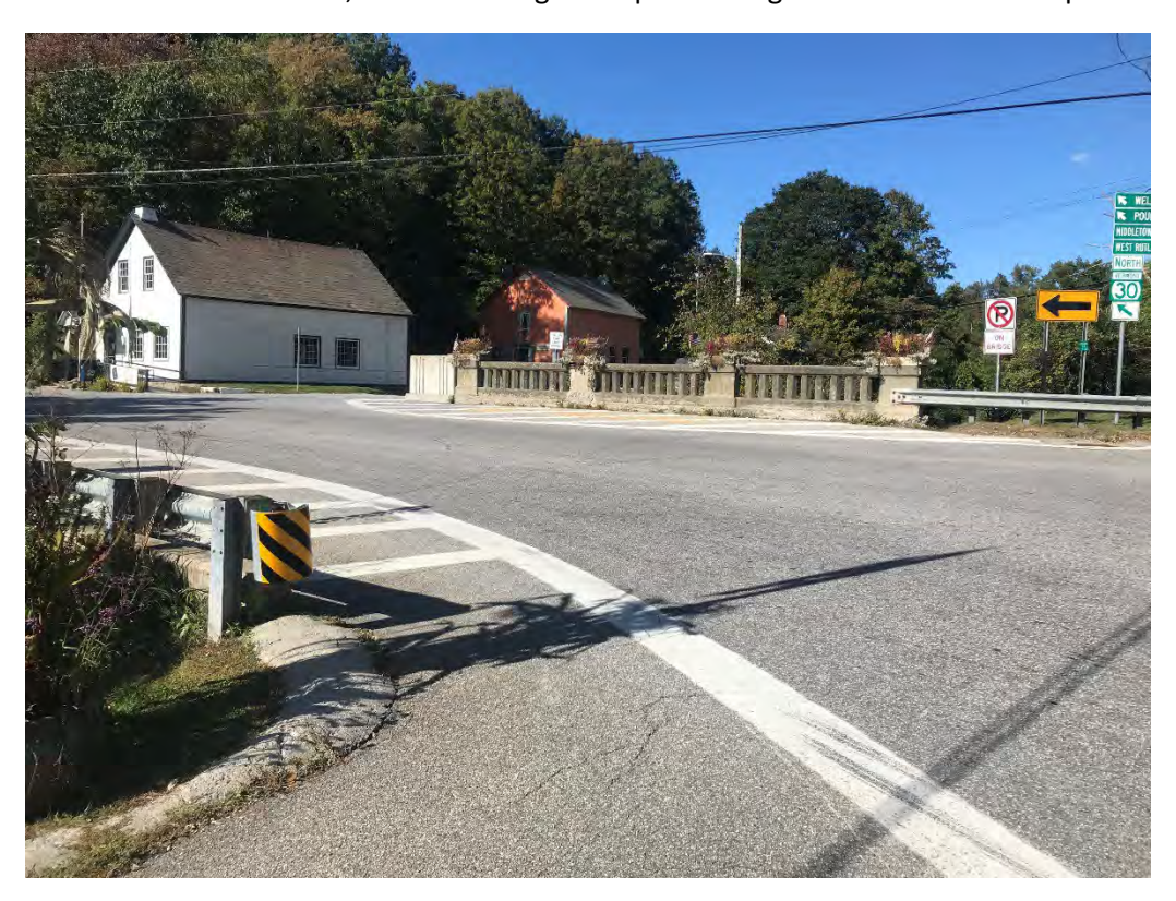
Sidewalks on the south side of VT-30 to access both School St and the Mach's Market parking area.