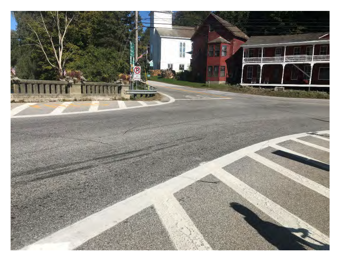
View of the crosswalk location, where rectangular rapid flashing beacons will warn of pedestrians.