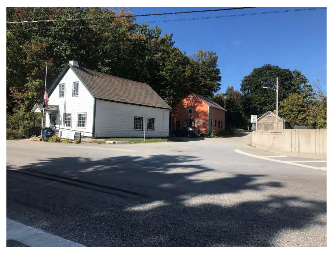
Sidewalks will extend to the Post Office and a crosswalk will be installed across Cemetery Hill.