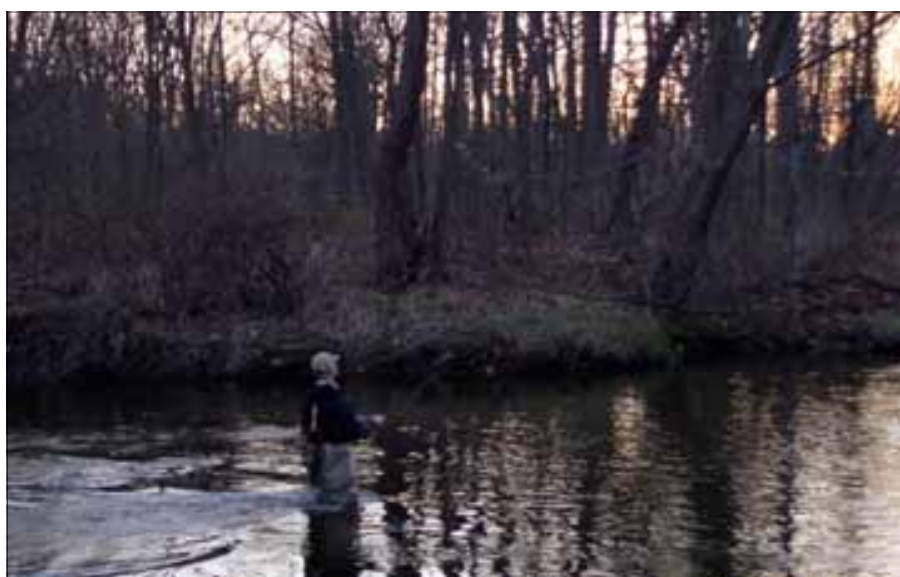
Fly-Fishing the surrounding rivers and brooks is a long-standing tradition in our Region that relies on healthy water ecosystems.